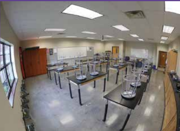
The newly renovated STEM lab

The Zielinski Music Suite is beautiful and functional. There is ample space for rehearsal, instruction and practice. The acoustically engineered room enables students to hear one another in greater detail.